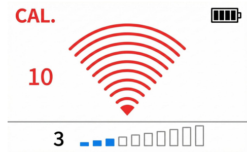
Uncalibrated & Reverse Polarity